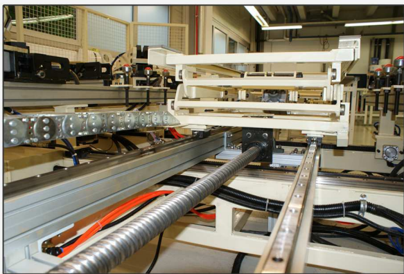
automated load & unload facility